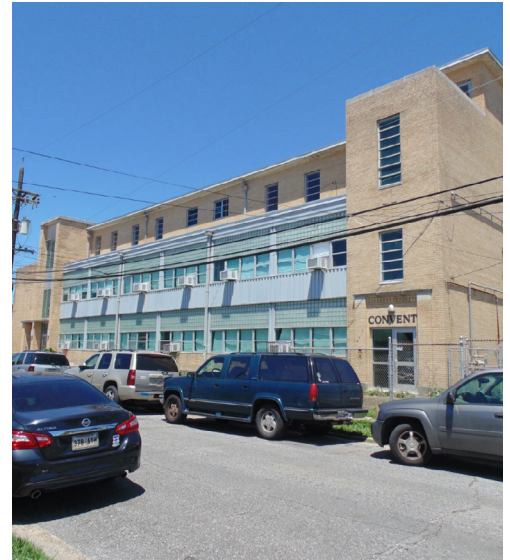
Our Lady of Lourdes School New Orleans, LA | Affordable Housing

The 1923 ice cream factory, with later mid-century additions, is a unique piece of South Carolina's twentieth century industrial and agricultural history. The Furman Co. is converting the manufacturing site into modern office spaces. MHA Charleston is completing state and federal historic tax credit applications for The Furman Co.