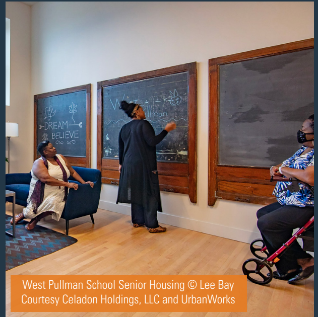
West Pullman School Senior Housing