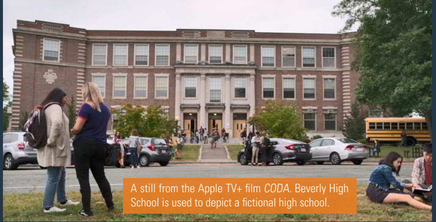
A still from the Apple TV+ film CODA . Beverly High School is used to depict a fictional high school.

Beacon Communities and Harborlight Community Partners are currently converting the historic school into the Briscoe Village for Living and the Arts (BVLA), a complex with 85 affordable apartments for seniors and six live/work studios for artists. The project features residential units located in former classrooms, newly created community spaces in the former gymnasium, a community park, and retention of the school’s historic theater. The $38 million rehabilitation is also focused on sustainability, as project partners aim to make the school a LEED Silver Certified building.