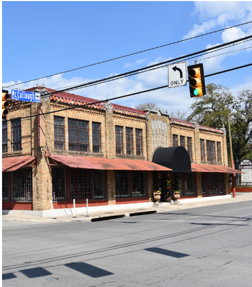
2101 McCullough San Antonio, TX | Offices