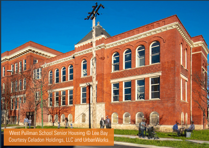
West Pullman School Senior Housing © Lee Bay Courtesy Celadon Holdings, LLC and UrbanWorks

Significant exterior and interior architectural features were preserved at the school. The exterior of the building features historic materials including red press brick with terra cotta and limestone trim. The new 60 residential units retain character-defining features of a former school, including original chalkboards, built-in bookcases, broad corridors, and a former nurse’s office. The school’s former large assembly spaces, including the historic gymnasium and auditorium, were also retained. The rehabilitation and construction work created more than 75 temporary jobs for locals and two permanent positions were added to staff the finished facility.