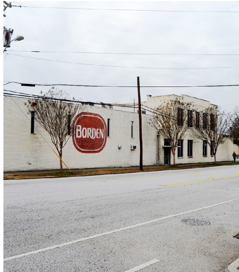
Borden Ice Cream Factory Greenville, SC | Offices

This early twentieth century property is nestled in a commercial cluster in San Antonio's Monte Vista Residential Historic District. Formerly a showroom for local furniture concerns (Noel Brothers and W.R. Dallas), Headwall Investments is rehabilitating the building for office use. MHA Houston is advising on state and federal historic tax credits for the project.