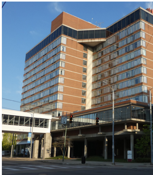
Stouffer's Dayton Plaza Hotel Dayton, OH | Mixed-Use

MHA New Orleans is consulting on the National Register nomination, and state and federal historic tax credits, for this former elementary school, built in 1957. Providence Community Housing is adapting the mid-century modern-style building into an affordable apartment complex with 62 apartments for low-income seniors.