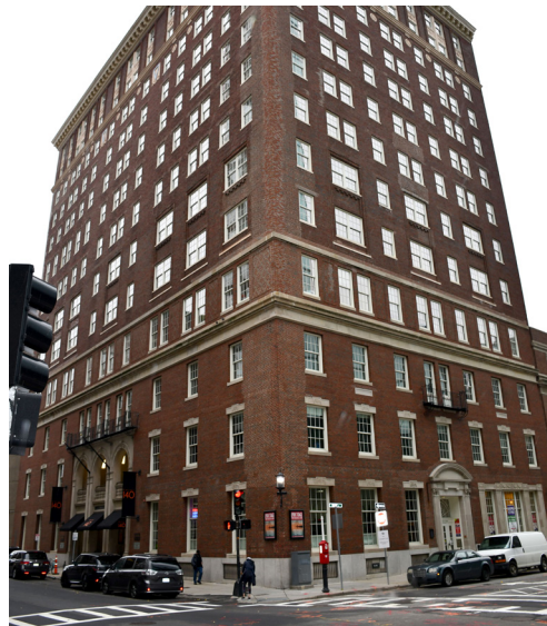
YWCA Boston Boston, MA | Affordable Housing

MHA Chicago is providing historic tax credit consulting services for this 1970s hotel in Dayton's commercial center. The building stands fourteen stories tall and is perched on concrete pillars, with glazed facades and skybridges. The building is being rehabilitated into hotel and affordable housing use by Veteran Services USA .